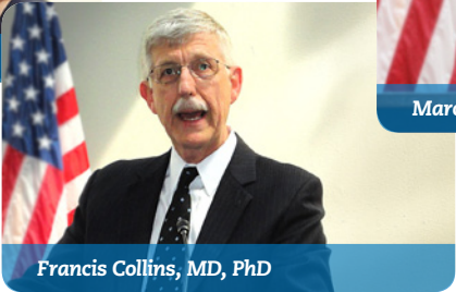
Francis Collins, MD, PhD