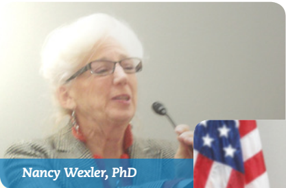
Nancy Wexler, PhD