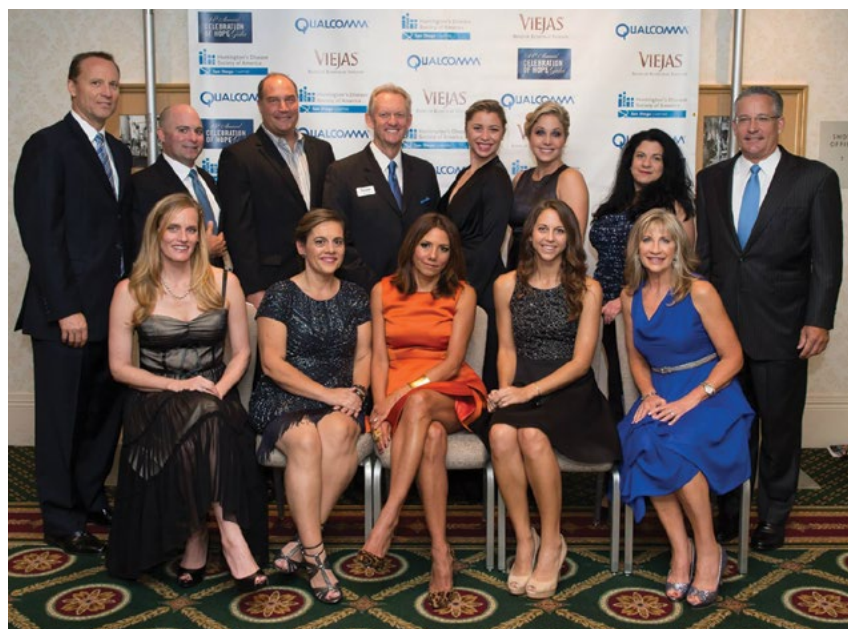
Pictured Above: HDSA San Diego Board